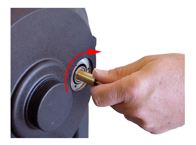
Step 3 Move Mirror Back to Expose C-Clip or Screw

Rotate the brass portion of the focus assembly clockwise . This will bring the mirror back and expose the threaded portion of the focus shaft. At the tip of this threaded bolt will be either a small C-clip or a screw which will be removed in the next step.