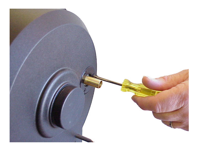
Step 2 Remove Focus Assembly Cover

There are 3 small screws which hold the focus assembly cover in place. These will be Phillips-head screws on newer scopes, but some models will have hex-head screws. Remove these screws and take off the flat cover plate, exposing the inside of the focus assembly.