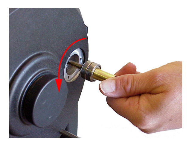
Step 5 Remove Focus Bearing Assembly

Rotate the brass portion of the focus shaft counterclockwise . This will unthread the brass shaft and bearing assembly from the threaded rod. Remove these parts entirely (you will turn the brass shaft quite a few times to remove it).