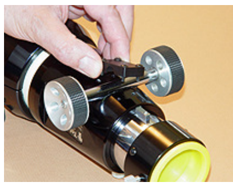
1.c. Remove the pinion cover.

1.a. Place the telescope on a towel or a clean work surface as shown.