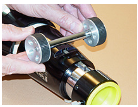
1.d. Remove the pinion assembly.

1.b. Using the 5/64 Allen wrench remove the (4) Button Head Cap Screws.