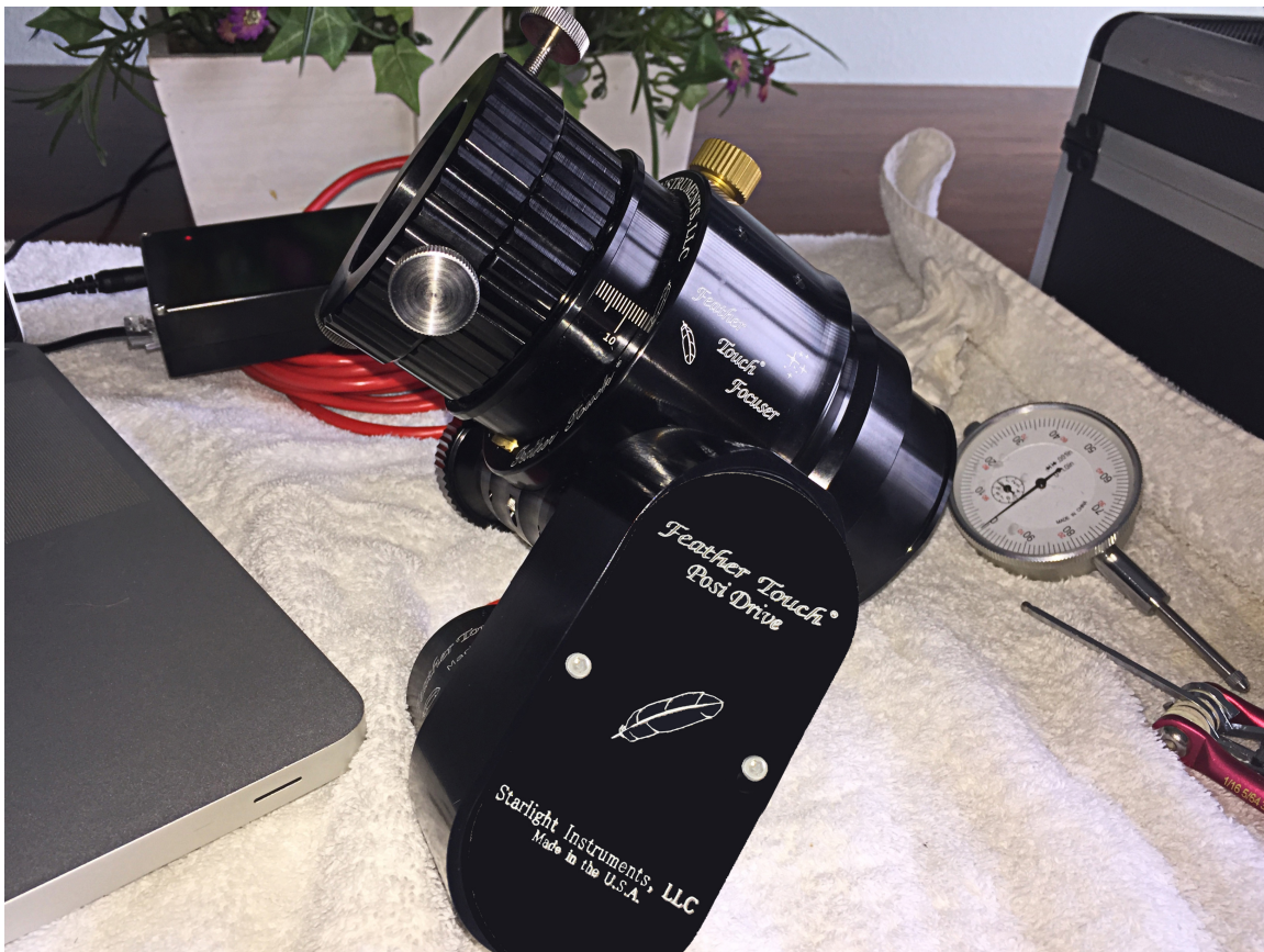
New Posi Drive Motor System on a 3" Feathertouch

Introducing Starlight Instruments new innovative Posi Drive Motor System , putting ultra high resolution focusing within reach of discerning astro imagers everywhere. Their new design is based loosely on the Starizona system but now incorporates a special high precision motor and reduction system that produces 24,000 step resolution for every 1 inch of travel. The new design works on all Feathertouch 2" and larger focusers and is very easy to install.