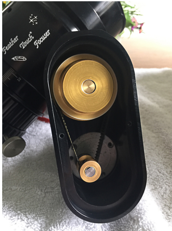
6 to 1 reduction gearbox

After Jon Joseph installed the Posi Drive Motor System on the scope, hooked up the cables to the control box, focuser and computer, we were ready to go. We started up the computer and the Focuser Boss II software installed without a problem. Turning on the control box the Focuser Boss II program automatically connected and we were ready to go. The first thing we did was test the focuser to make sure everything was connected properly. The ability to control the number of steps the focuser moves is one of its best features. As I mentioned earlier the new system has 24,000 steps per 1 inch of travel (2.54 cm) putting that another way .004 inch for every 100 steps. This resolution is only available on the most expensive systems on the market.